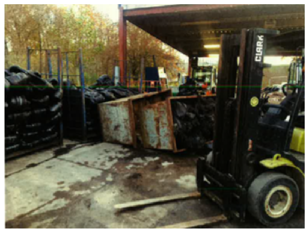
Pirelli's site on Dalston Road, Carlisle.

He fractured four lumbar vertebrae, his left femur and was hospitalised for several weeks as a result of the incident.