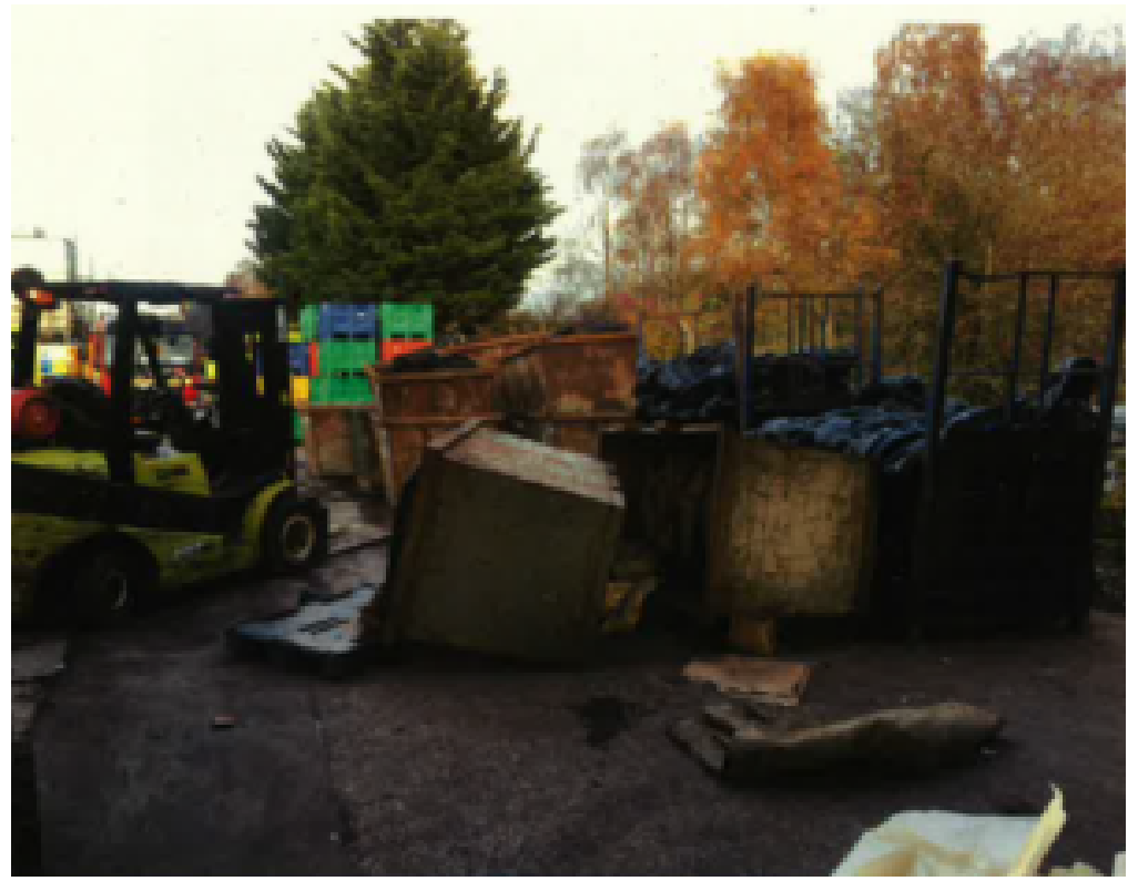
Pirelli's site on Dalston Road, Carlisle.

Mr Weightman was servicing a fork lift truck that was parked up against a stack of waste tyres on a stillage. Two metal skips were positioned on top of the stack.