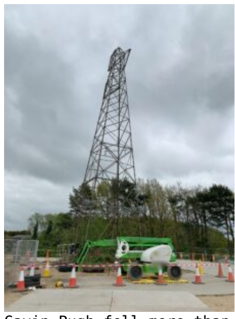
Gavin Pugh fell more than 30 feet during work to demolish electricity pylons in East Staffordshire

North Wales man Gavin Pugh had been demolishing and replacing electricity pylons in East Staffordshire when the incident happened on 6 April 2022.