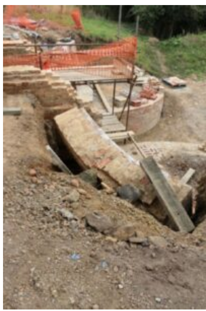
A section of the wall collapsed while Mr Konitzer was inside the excavation

removing temporary propping that was supporting the wall when a section of it collapsed.