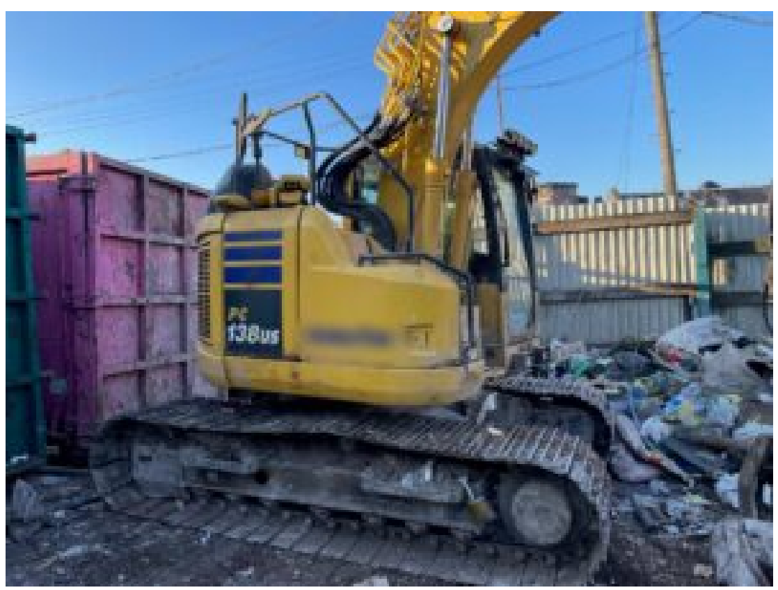
The worker was struck and run over by an excavator (pictured here)

As the trio were working, a 360-excavator was being used to move waste in the same area. CCTV footage showed that the excavator was being used close to the workers on the ground.