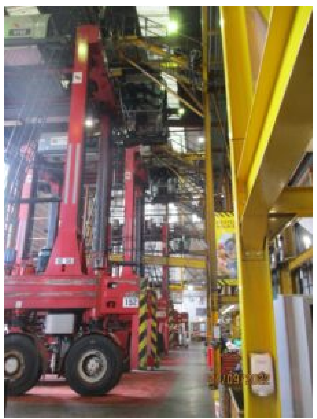
The incident took place at DP World Southampton's terminal

The HSE investigation found Southampton Container Terminals Limited had failed to ensure there was a system of work that ensured the replacement of the glass floor and routine maintenance work could be carried out safely at the same time. The company also failed to ensure there was a risk assessment in place and failed to implement its own policy for the use of permits to work whilst working at height.