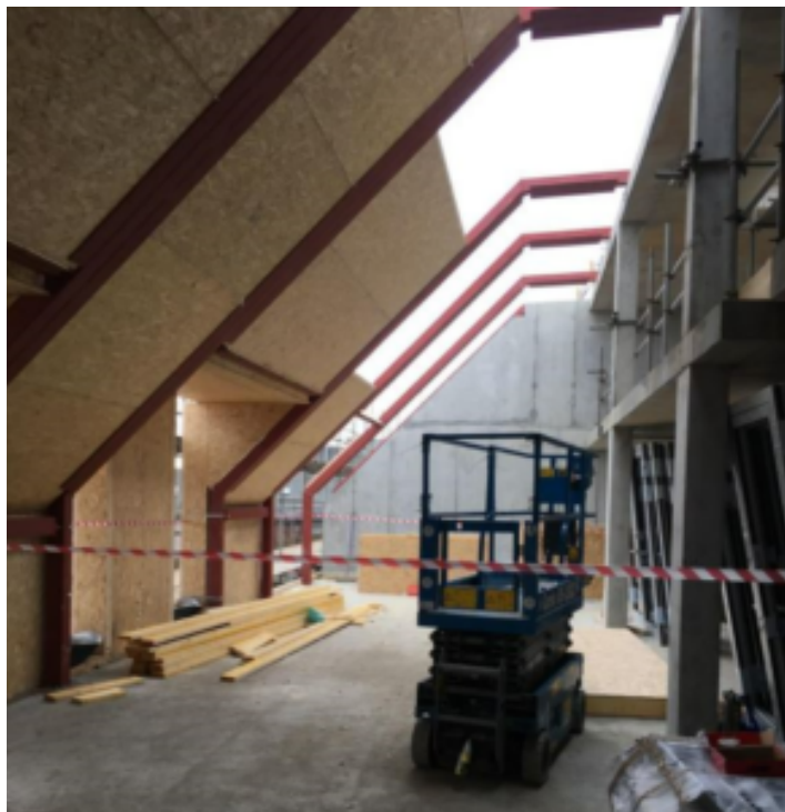
The construction site at Eskdale Terrace, Jesmond, Newcastle

HSE's investigation also identified Clad Build UK Limited (trading as SIP Build UK), as the contractor responsible for the design, supply and installation of the SIPs. Clad Build UK Limited failed to plan, manage and monitor the work or to provide the necessary information and instruction to workers on how to prepare the SIPs for lifting. Clad Build UK Limited also failed to ensure effective supervision and monitoring of work being undertaken by a sub-contractor working under its control and to comply with requests for information from the principal contractor.