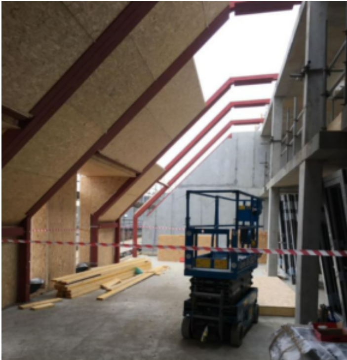
The construction site at Eskdale Terrace, Jesmond, Newcastle

HSE's investigation also identified Clad Build UK Limited (trading as SIP Build UK), as the contractor responsible for the design, supply and installation of the SIPs. Clad Build UK Limited failed to plan, manage and monitor the work or to provide the necessary information and instruction to workers on how to prepare the SIPs for lifting. Clad Build UK Limited also failed to ensure effective supervision and monitoring of work being undertaken by a sub-contractor working under its control and to comply with requests for information from the principal contractor.