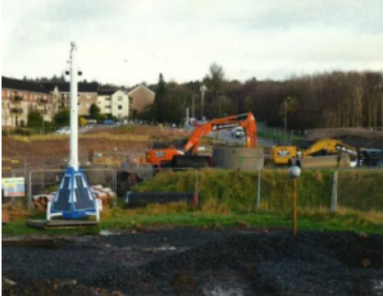
The construction site adjacent to Glenkirk Drive

An investigation by Police Scotland and the Health and Safety Executive (HSE) found that insufficient measures had been taken to prevent children gaining access to the construction site.