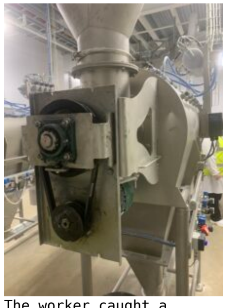
The worker caught a finger in the pully on a flour sifter machine

The then 31-year-old was assisting colleagues as they attempted to maintain the machine by clearing a blockage at the plant in Corby on 2 February 2023. Following removal of a guard, as the engineer assisted with the task, he checked the tension of a drive belt and his hand got pulled around the bottom pully which resulted in the amputation of part of his right middle finger. The engineer was unaware that the machine had been switched back on.