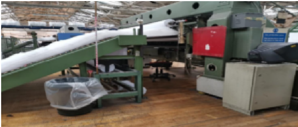
The quilting machine being used by the worker

However, his gloves became tangled in the machine, causing his right hand to be dragged in. This caused lacerations and crush injuries to his right hand and resulted in the tips of two of his fingers to be amputated.