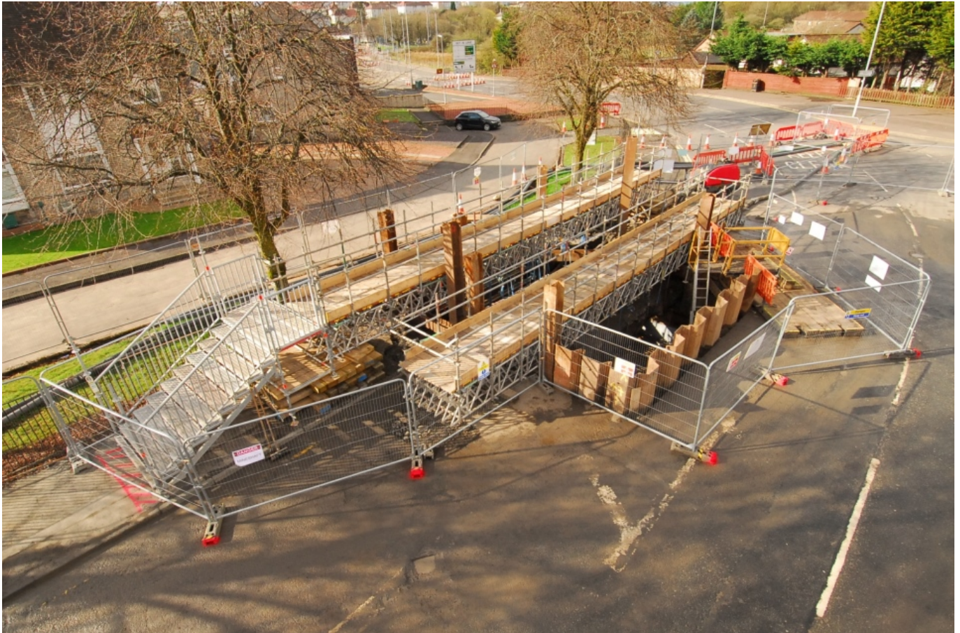
The Coal Authority's works at Kilbowie Road, Clydebank

This repair was further complicated by exposed utility services in the void that needed to be protected during the works. A fractured foul water sewer and storm water drain within the ground collapse also made the repair more complex, with water needing to be pumped over 150 metres around the void during the works.