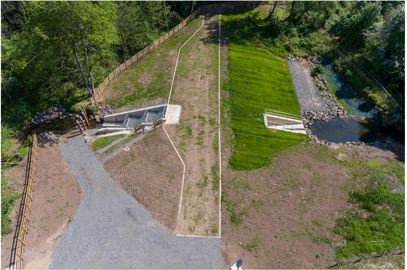
Cotting Burn dam aerial image

The dam works alongside other flood protection measures to reduce flood risk to around 1,000 properties in Morpeth.