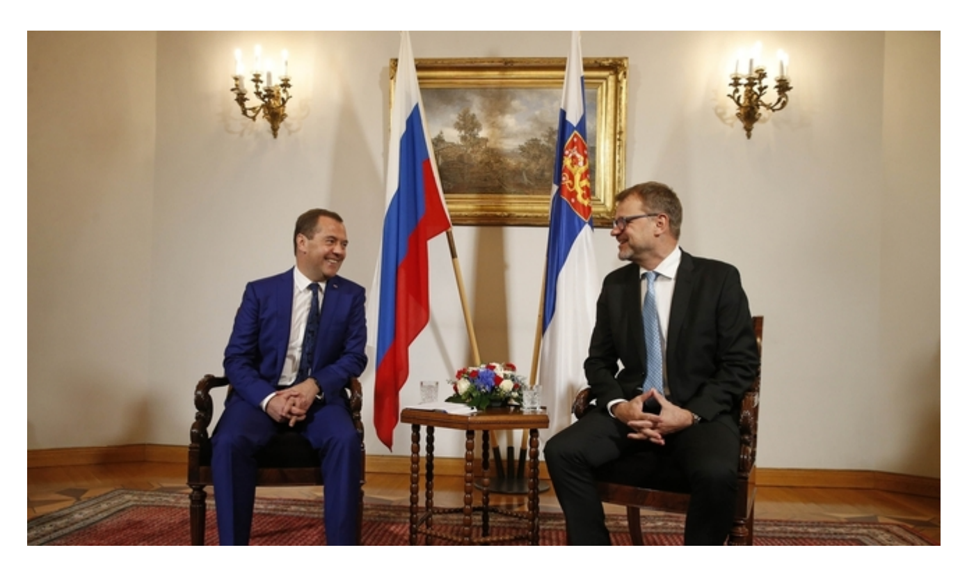
Dmitry Medvedev's conversation with Prime Minister of Finland Juha Sipilä