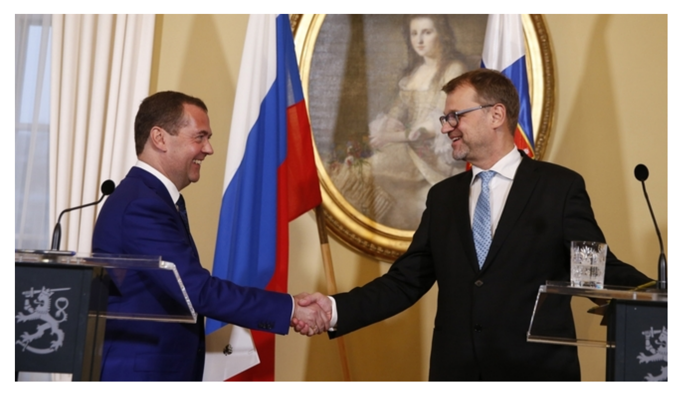
Joint press conference by Dmitry Medvedev and Prime Minister of Finland Juha Sipilä