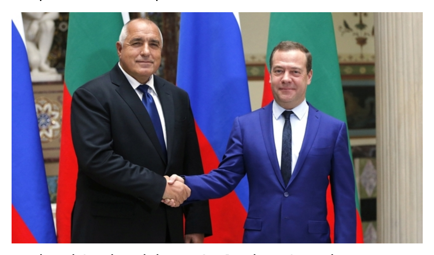
Meeting with Prime Minister of Bulgaria Boyko Borisov