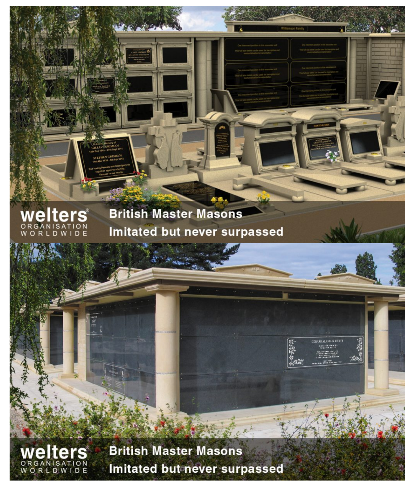
The post <u>Copyists Beware</u> appeared first on <u>Latest News</u>.