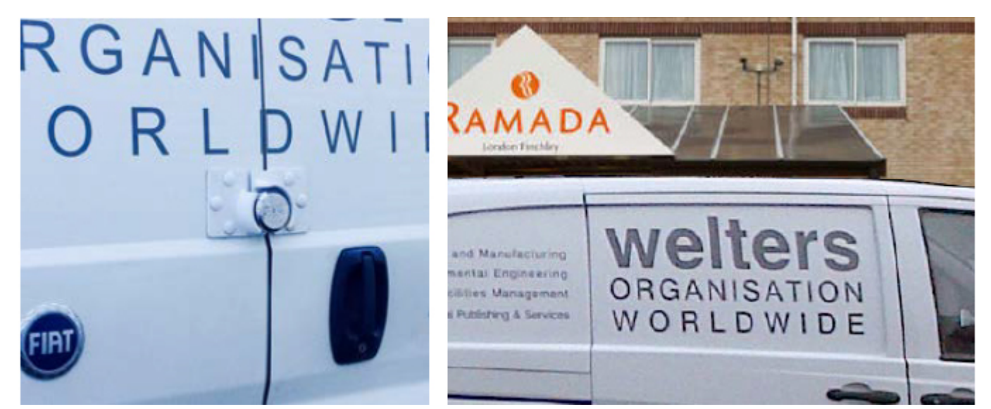
Hotel car parks can provide easy pickings for thieves

Police seemingly powerless to combat epidemic levels of theft from commercial vehicles.