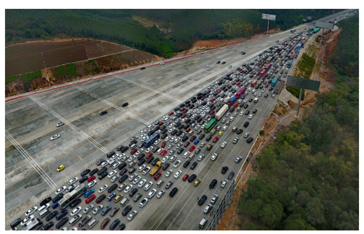
Traffic slows to a crawl on the Liuzhou-Nanning Expressway in the Guangxi Zhuang autonomous region on Thursday as the highway is overwhelmed with travelers returning home.

Traffic slowed to a crawl on major highways on Thursday as tens of millions of people returned home after the Spring Festival holiday.