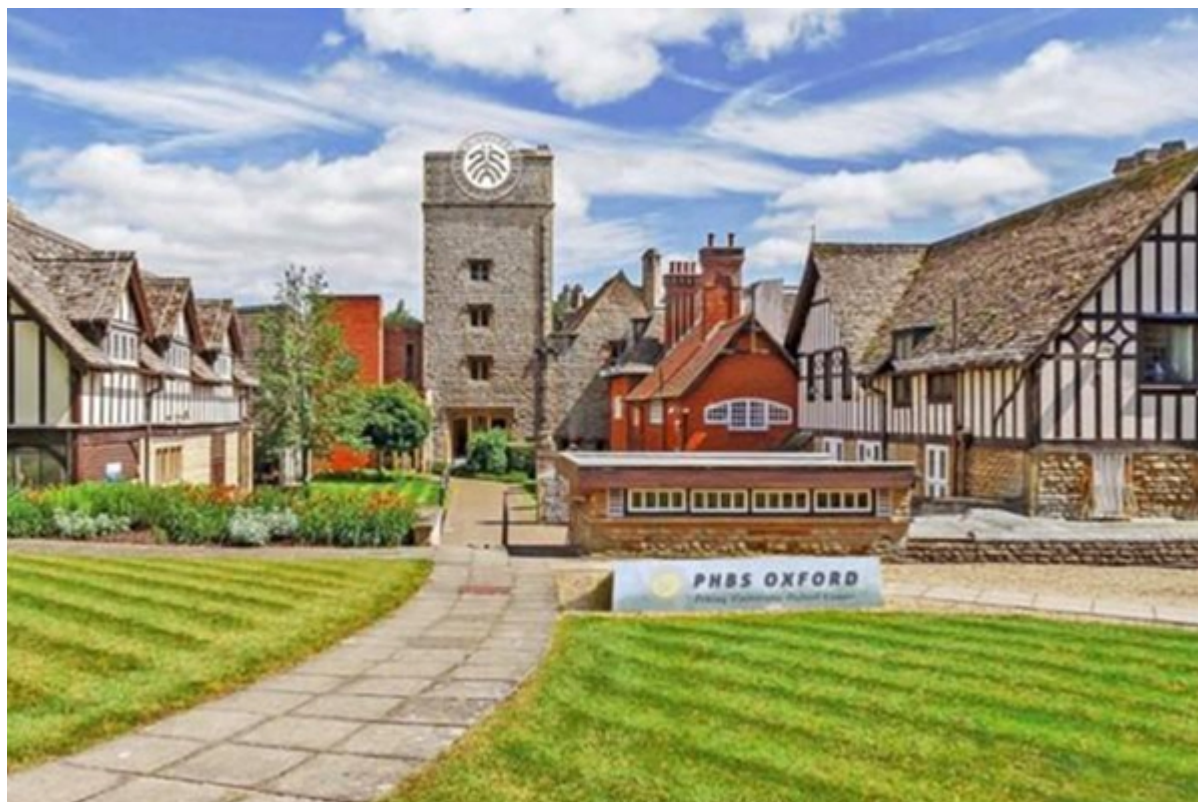
The site where the Peking University is to set as their British campus.

Peking University is set to start staff recruitment and student enrollment