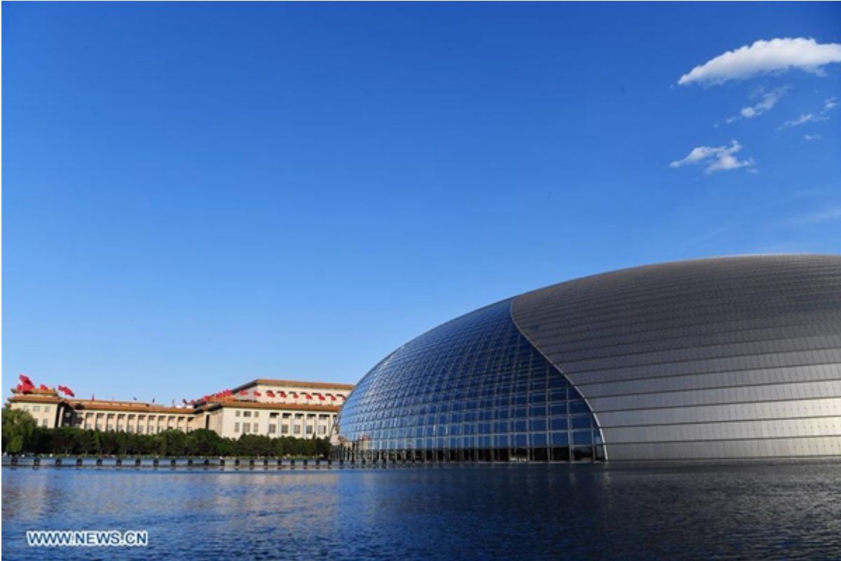
Photo taken on May 13, 2017 shows the National Centre for the Performing Arts and the Great Hall of the People in Beijing, capital of China. The Belt and Road Forum (BRF) for International Cooperation will be held in Beijing from May 14 to 15.

The Chinese capital is in Belt and Road time with high hopes that the Belt and Road Forum for International Cooperation means a new dawn for globalization.