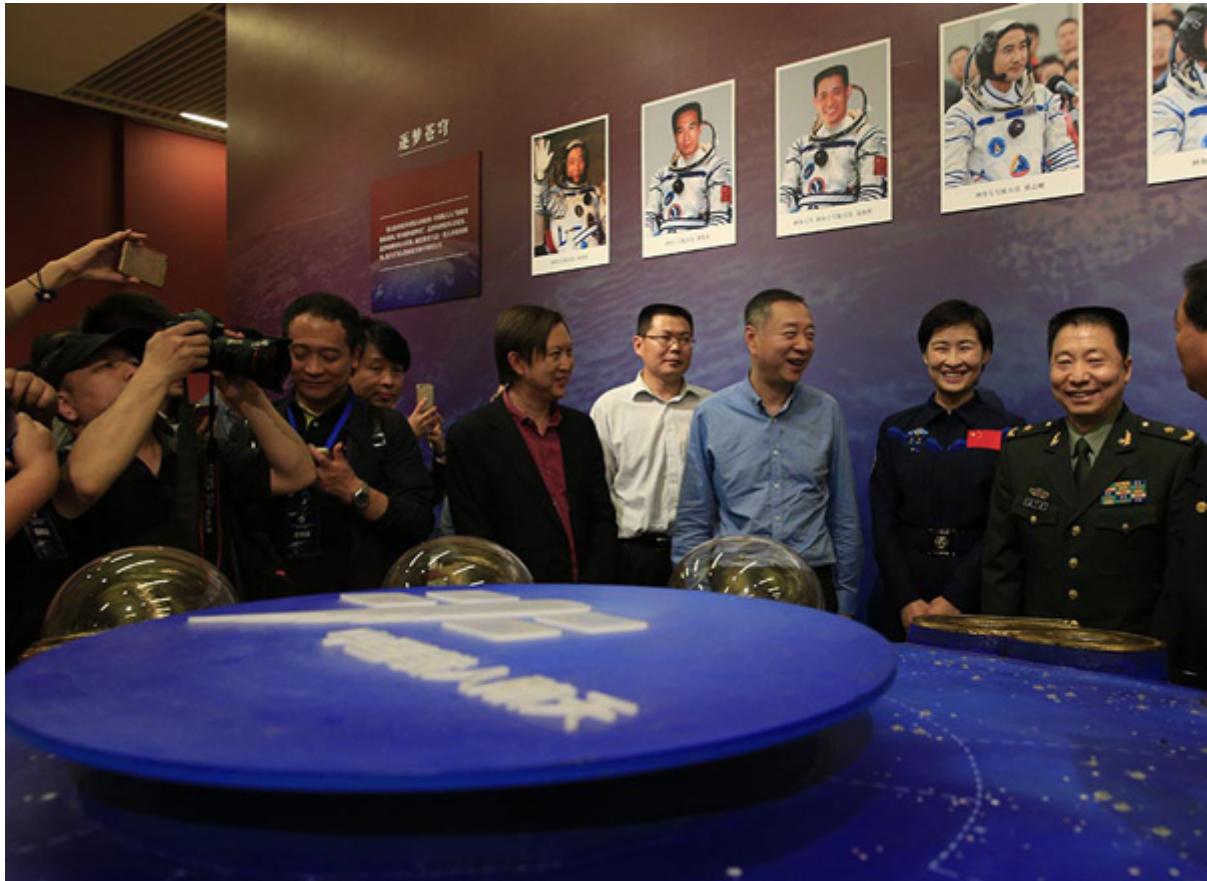
Chinese astronauts Yang Liwei (first from right) and Liu Yang (second from right) at an Aerospace Objects Exhibition at the National Museum of China in Beijing on April 24, 2017.

China will select the third batch of astronauts this year for its manned space exploration plan, according to Yang Liwei, deputy director of the China Manned Space Engineering Office and China's first astronaut to go into space.