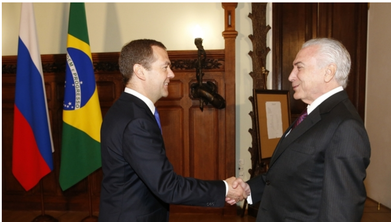
Meeting with President of Brazil Michel Temer