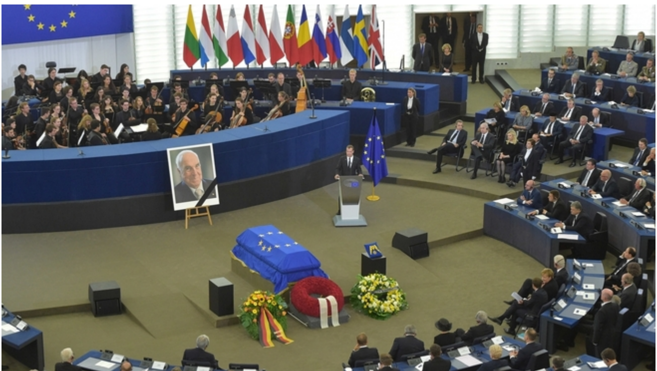
The memorial ceremony for former Federal Chancellor of Germany Helmut Kohl