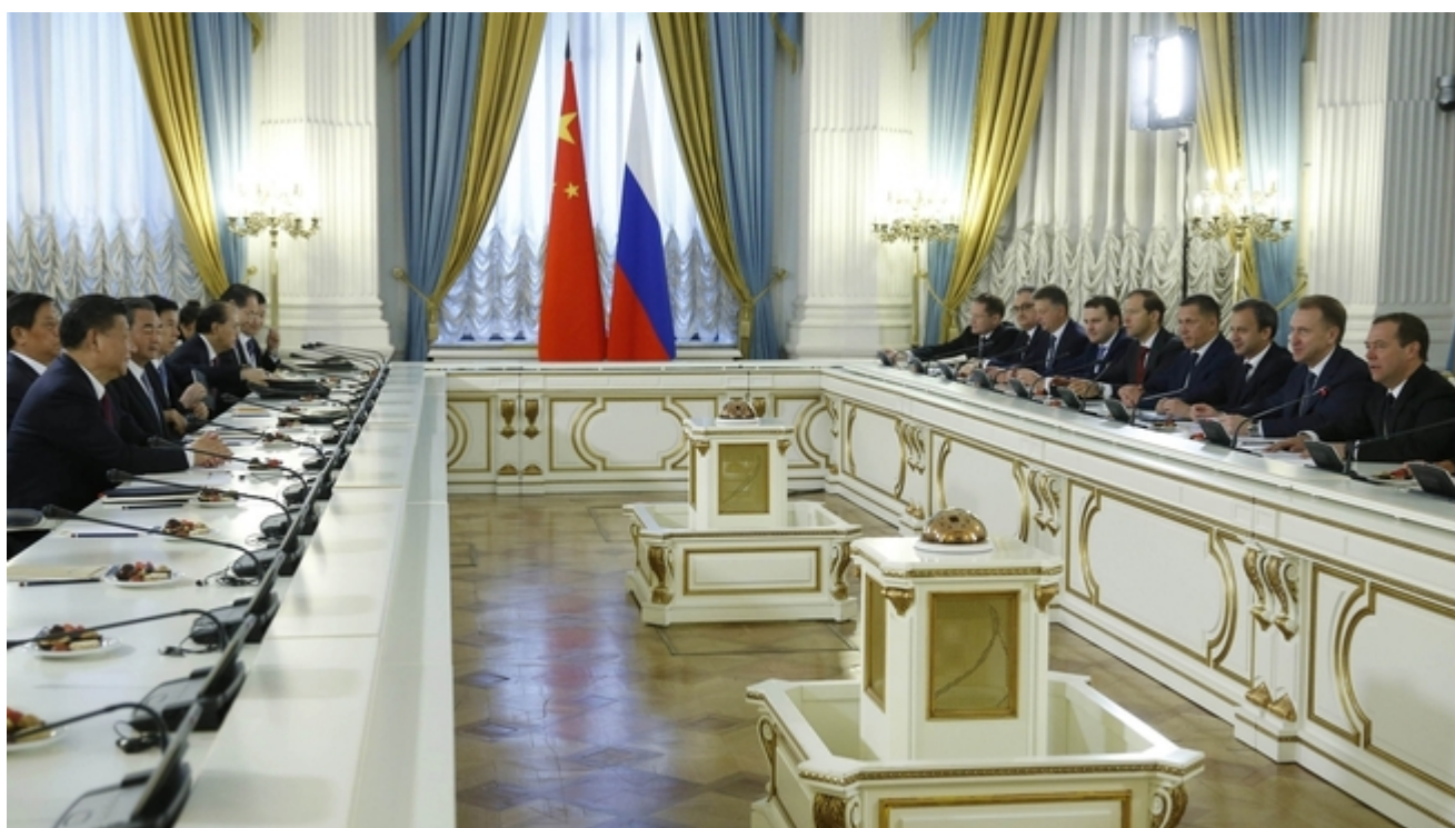
Meeting with President of China Xi Jinping