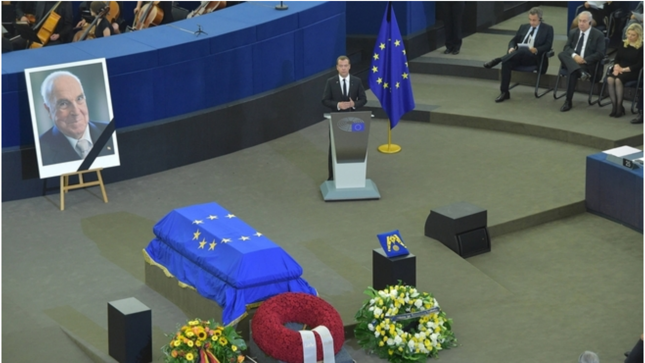
The memorial ceremony for former Federal Chancellor of Germany Helmut Kohl