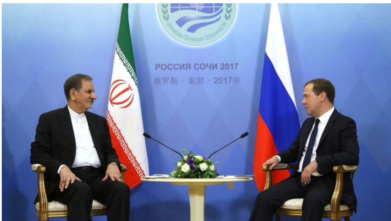
Conversation with First Vice President of the Islamic Republic of Iran Eshaq Jahangiri