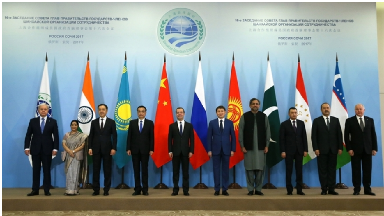
Joint photo session of the heads of the SCO member states' delegations