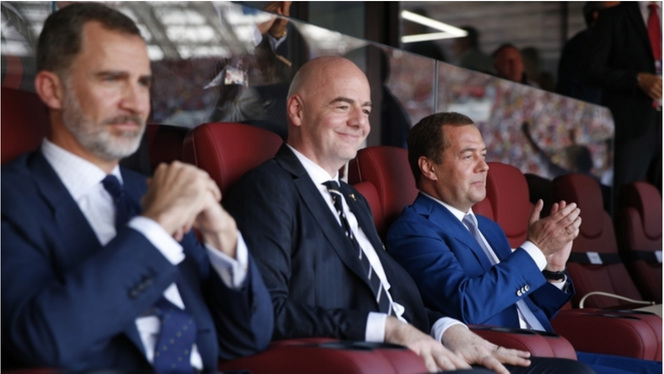
At Russia vs. Spain 2018 FIFA World Cup match