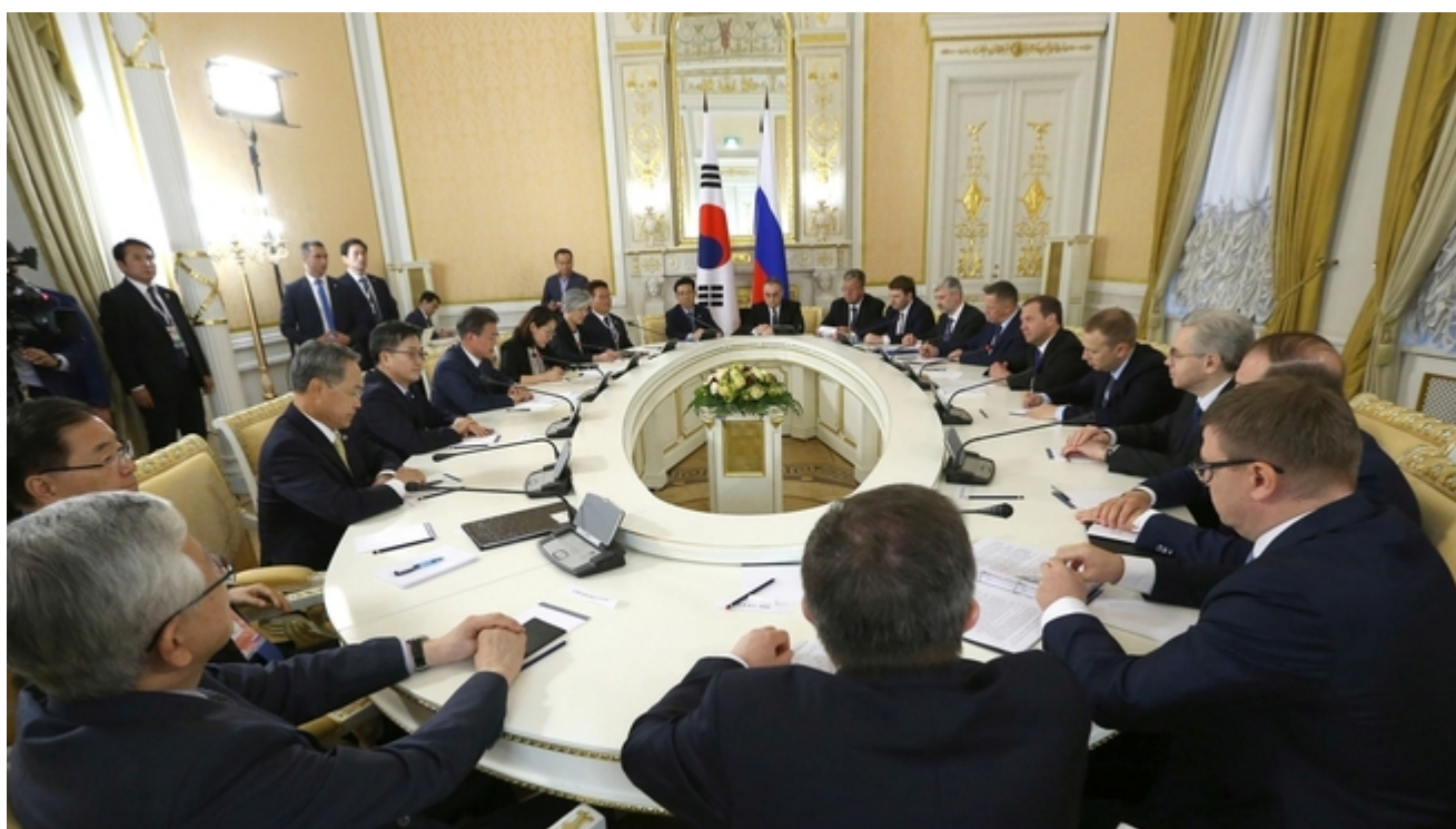
Meeting with President of the Republic of Korea Moon Jae-in