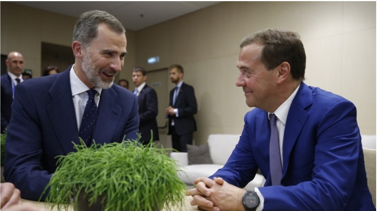
Meeting with King Felipe VI of Spain