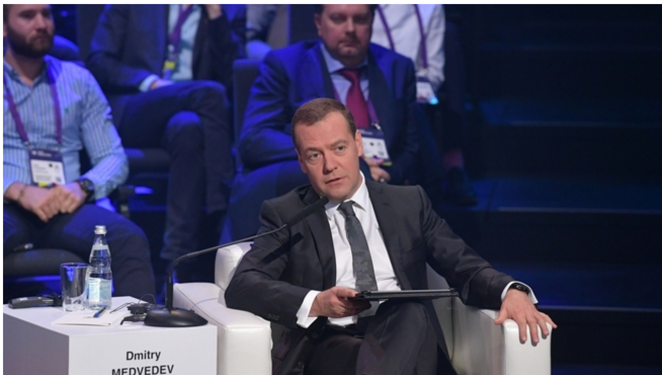
Plenary session of the 7th Open Innovations Moscow International Forum