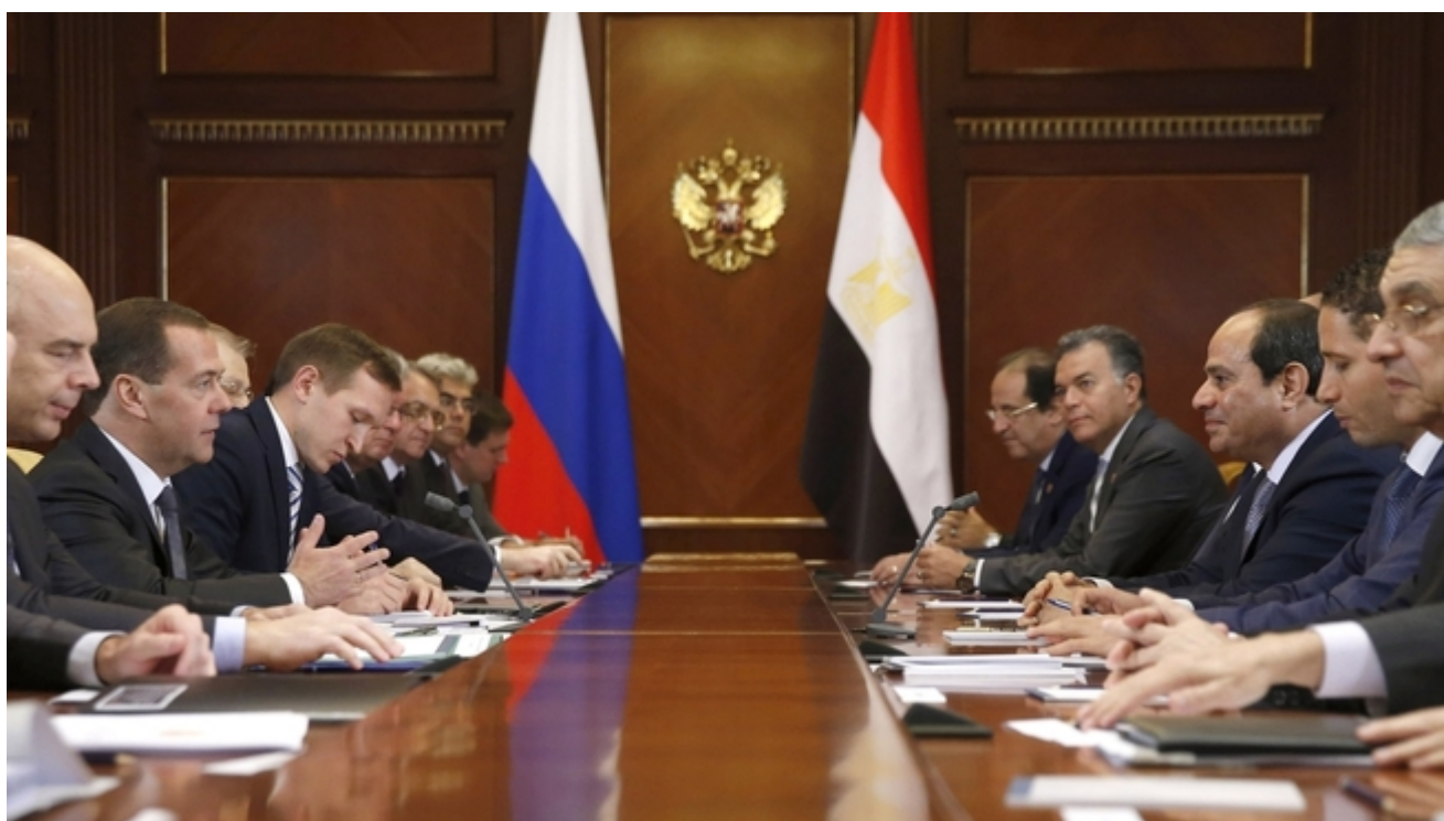
Dmitry Medvedev's meeting with President of Egypt Abdel Fattah el-Sisi