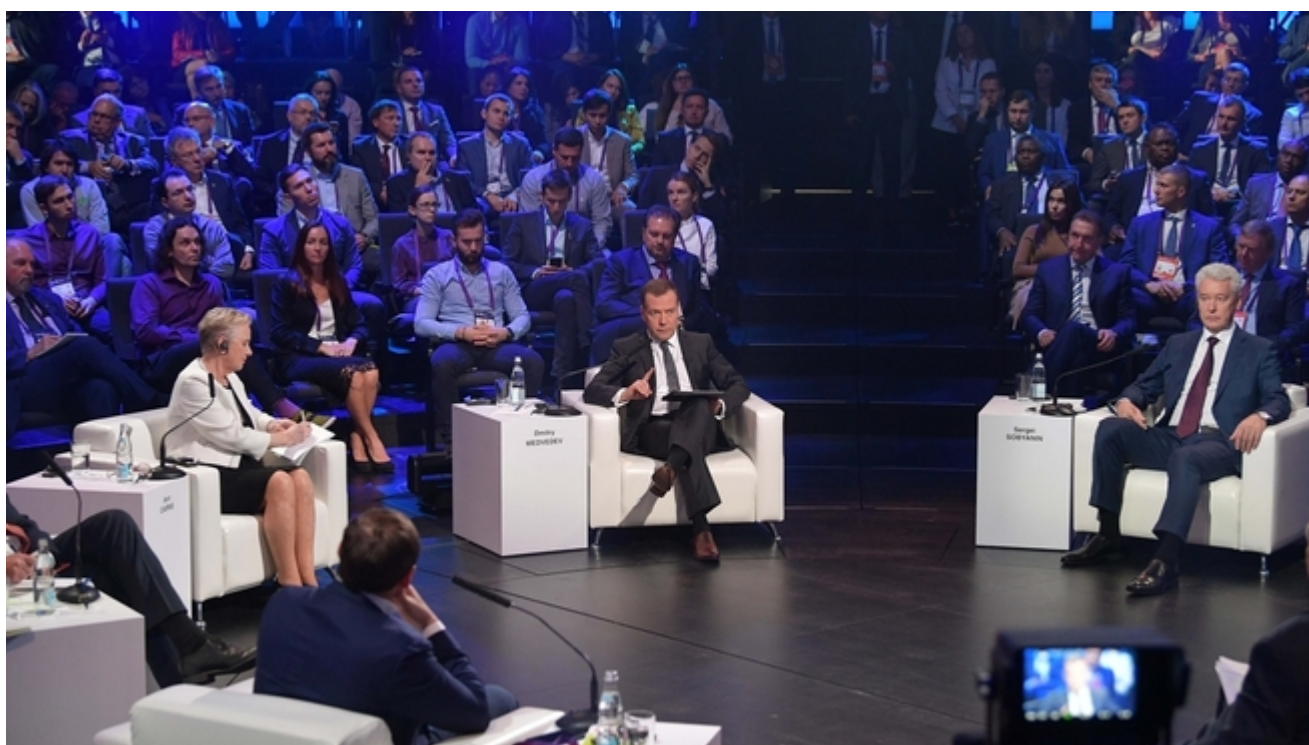
Plenary session of the 7th Open Innovations Moscow International Forum