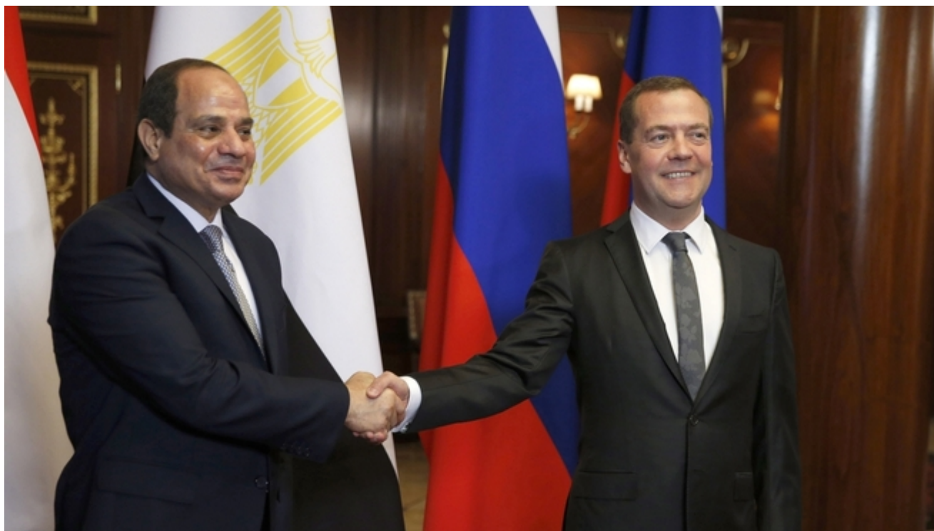
Dmitry Medvedev's meeting with President of Egypt Abdel Fattah el-Sisi