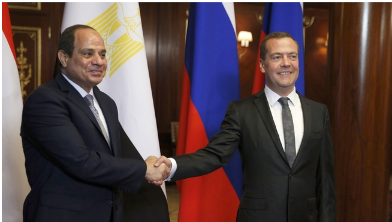
Dmitry Medvedev's meeting with President of Egypt Abdel Fattah el-Sisi