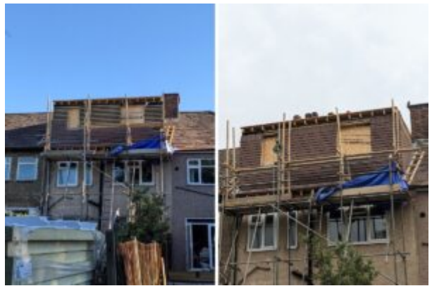
The scaffold was a potentially dangerous structure at risk of collapse and in breach of the HSE prohibition notice.

Falls from height remain the leading cause of death within the construction industry and <u>HSE has published guidance</u> about how these incidents can be avoided.