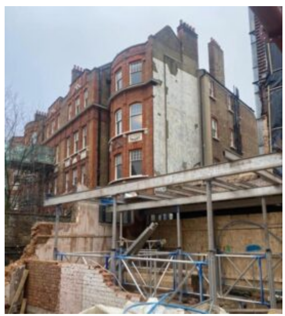
The site on Kensington High Street before the platform collapsed

Henry Construction Projects Limited, of Church Road, Cranford, Hounslow, London, pleaded guilty to breaching Regulation 6(3) of the Work at Height Regulations 2005. The company was fined £234,000 and ordered to pay £12,369 in costs at Westminster Magistrates Court on 16 May 2023.