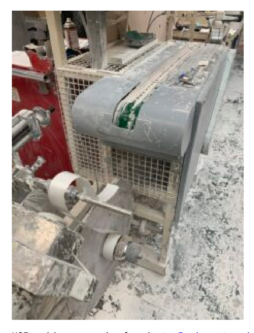
HSE guidance can be found at: <a href="Equipment and machinery"><u>Equipment and machinery - HSE</u></a>

HS Butyl Limited, of Gordleton Industrial Park, Hannah Way, Lymington, Hampshire, pleaded guilty to breaching Regulation 11(1) of the Provision and Use of Work Equipment Regulations 1998. The company was fined £80,000 and ordered to pay £4,945.90 in costs at West Hampshire Magistrates' Court on 23 June 2023.