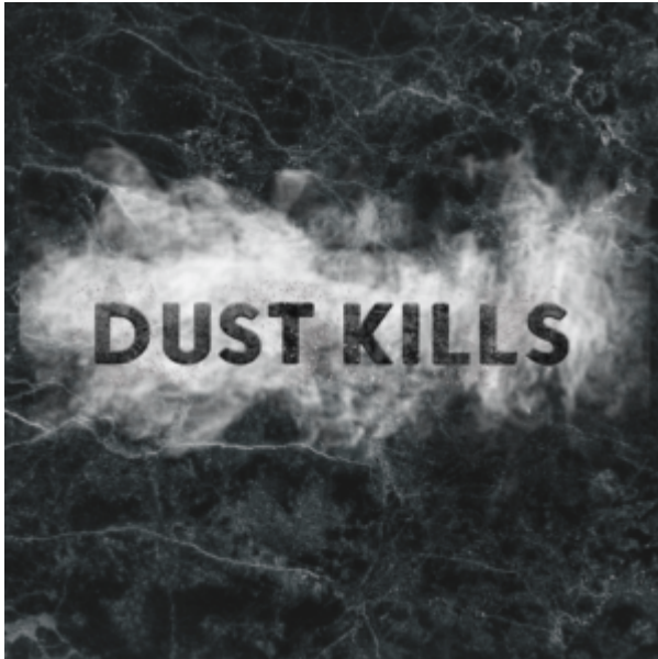
Dust Kills campaign

A snapshot of good and bad practices of how workers' exposure to dust is being managed and controlled on construction sites across Great Britain has been revealed.