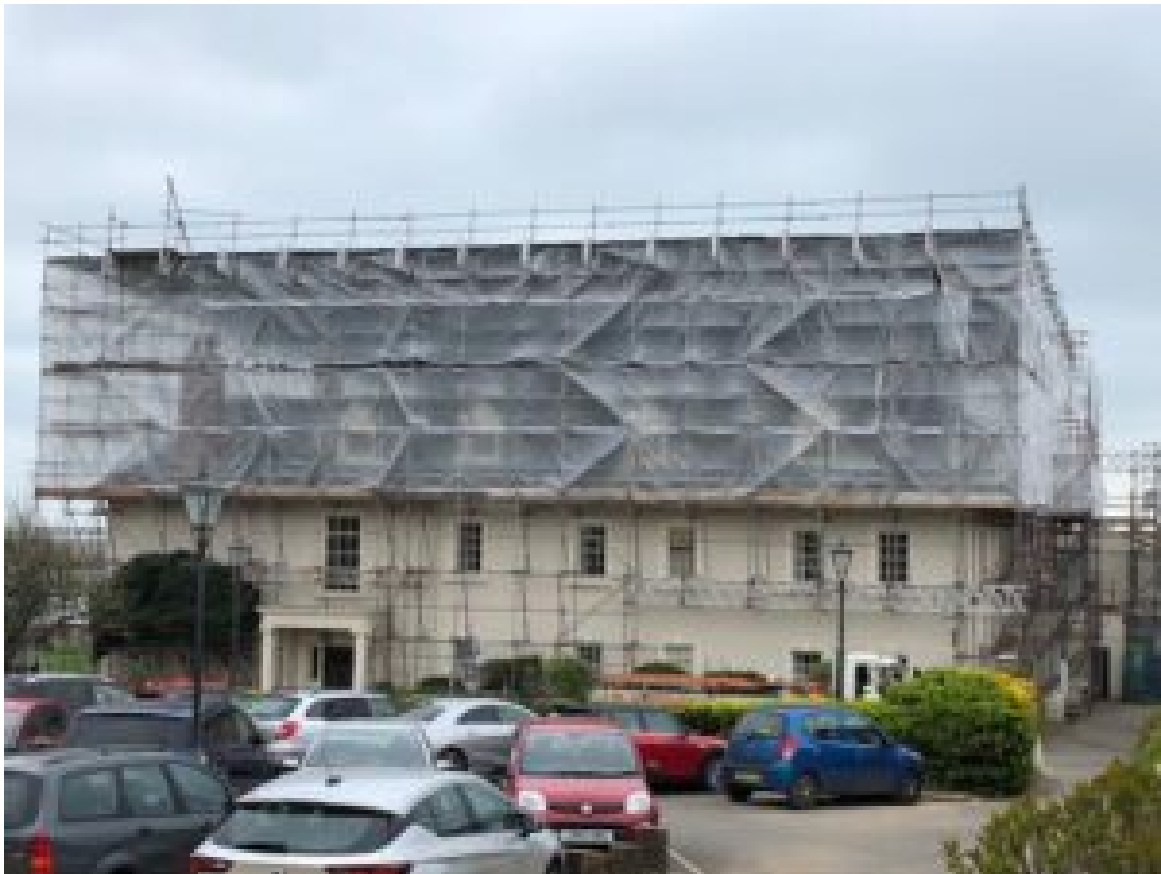
Moonfleet Manor hotel

The pre-schooler received first aid and was later taken to hospital where she was put into an induced coma to stabilise her. She then underwent a two-hour operation to remove fragments of slate from her head.