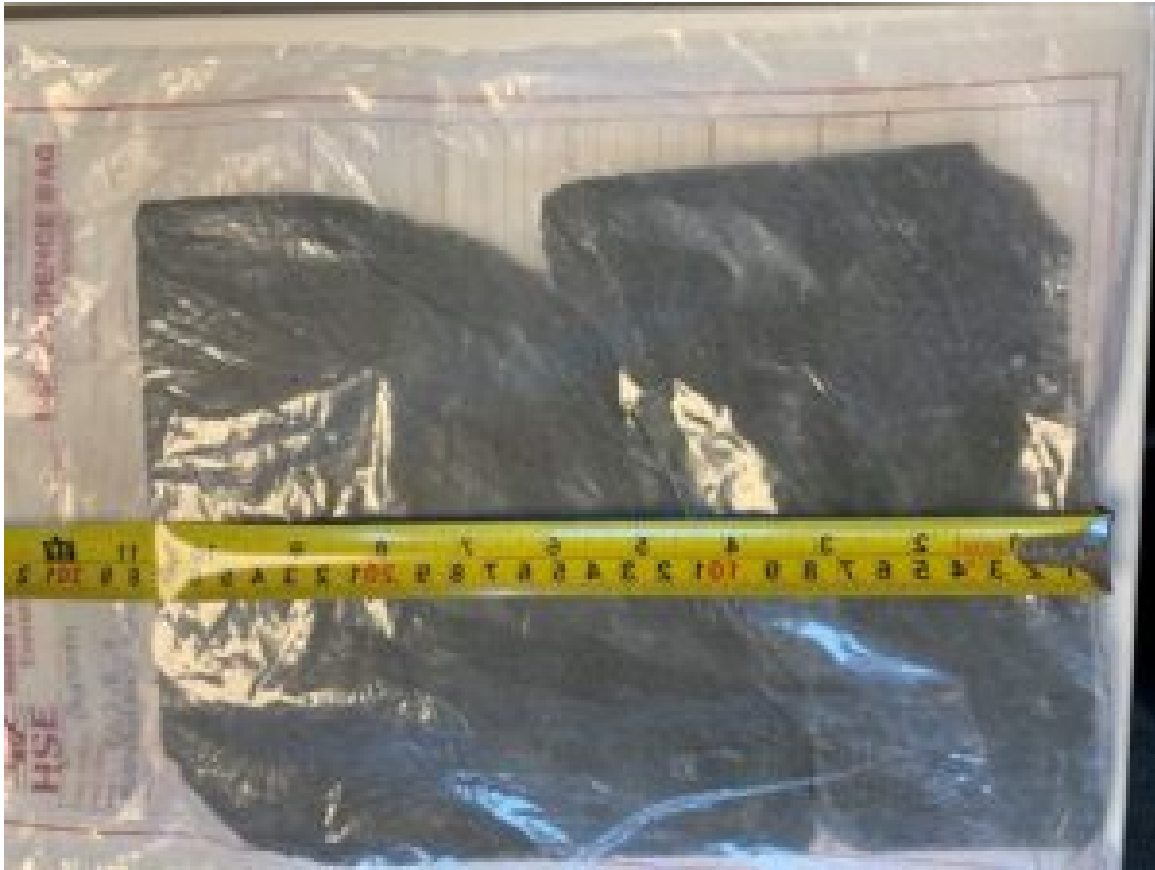
The piece of slate that hit the child

Rocare Building Services Limited had been appointed by Moonfleet Manor as the principal contractor to oversee the refurbishment work which also included replacing windows and restoring chimneys and gutters.