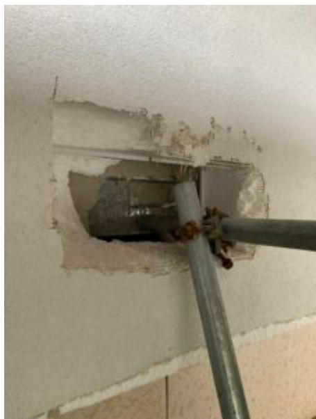
Combustible material exposed where scaffold is attached to the building

When an inspector from the Health and Safety Executive (HSE) first visited the site on 10 January 2022, the inspection revealed that, in preparation for the removal work, combustible material had been left exposed and there were inadequate means of escaping from the scaffold which was being erected.