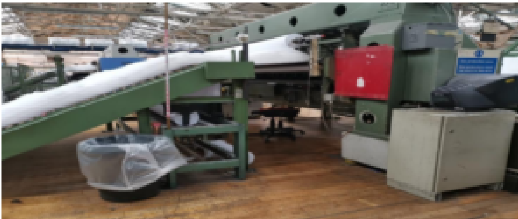
The quilting machine being used by the worker

However, his gloves became tangled in the machine, causing his right hand to be dragged in. This caused lacerations and crush injuries to his right hand and resulted in the tips of two of his fingers to be amputated.