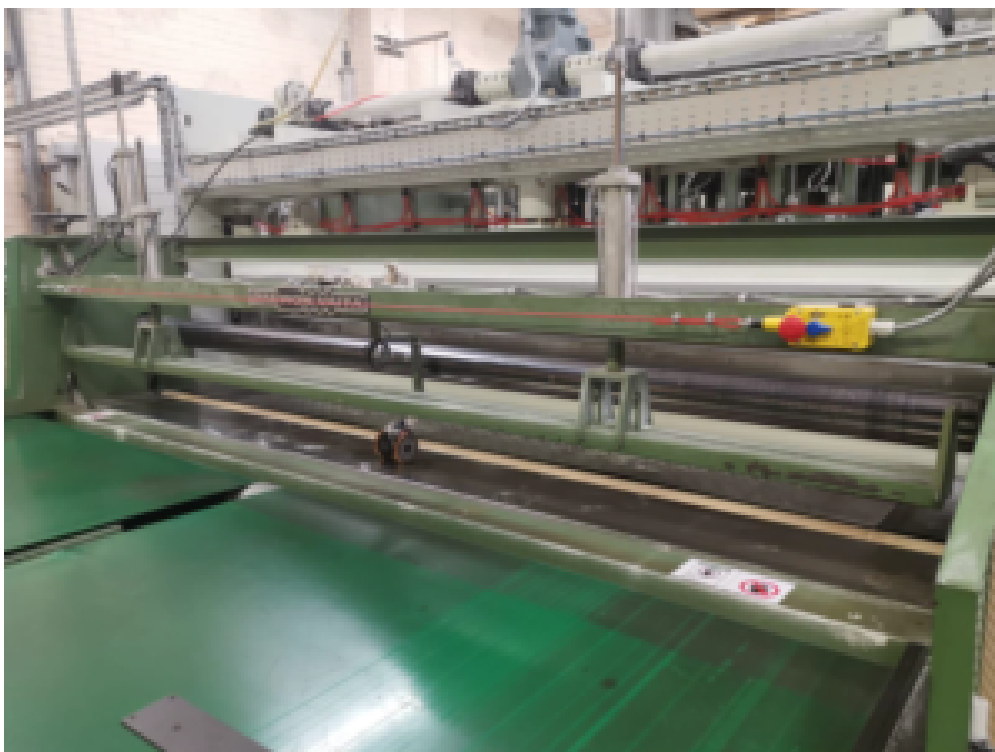
The cutting machine the employee was operating at the

The first incident took place on 29 March 2020 and involved a 32-year-old employee from Burnley. On his first day working on the line, he was instructed to clean the measuring wheel on a cutting machine. He climbed onto the conveyer belt, however the cutting machine had not been properly isolated from all sources of power and the machine’s clamp came down, trapping the employee’s left hand and causing the circular saw to move.