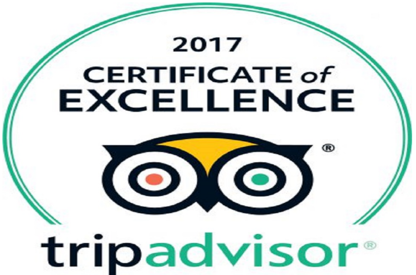
Tripadvisor 2017 certificate of excellence