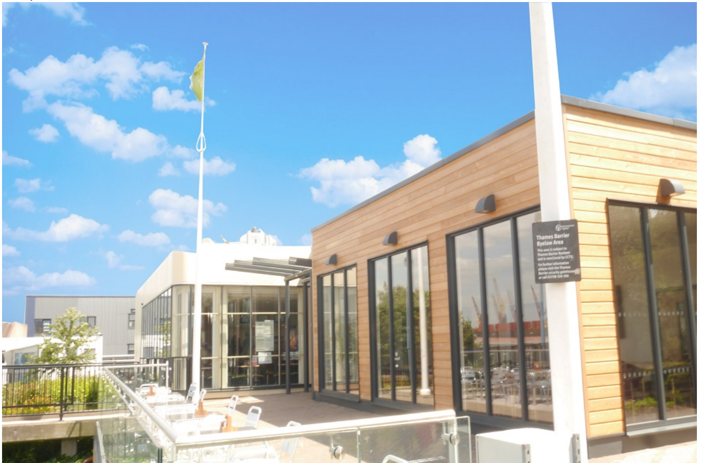
New Thames Barrier cafe and information centre

The centre has an additional conference room and improved outdoor seating area, which allows the Environment Agency to offer more availability for