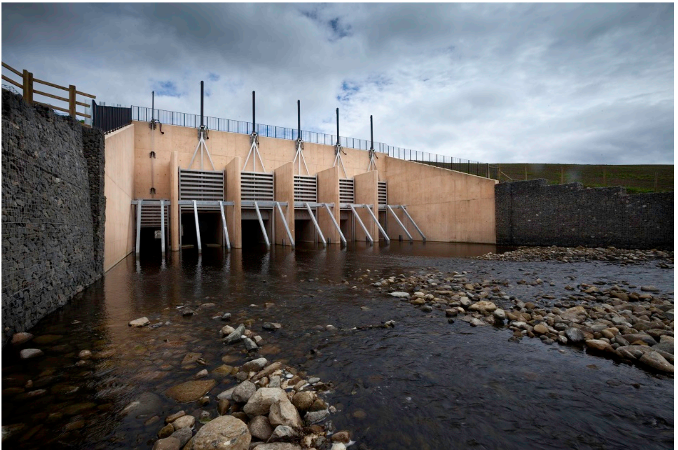
The large dam at Mitford

This has been a great partnership involving local residents, who have played, and continue to play, a vital role in the success of the scheme. It shows that by working together with others we can create long term solutions to reduce the risk of flooding in our communities.