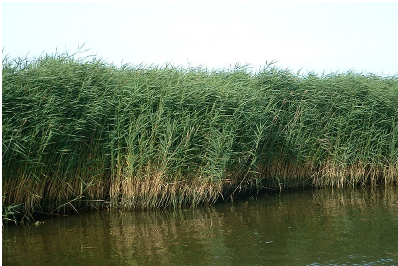
A reedbed at Stover Lake