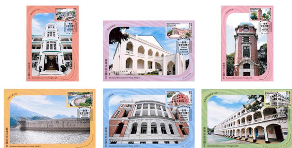
Maximum Cards A set of 6 cards affixed with the relevant stamp on the picture side (date-stamped with the associated special postmark). 貼附明信片 一套六款，在印有圖案的一面貼上相關郵票 (以相關的特別郵戳蓋銷)。