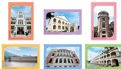
Postcards (a set of 6 cards). 明信片 (一套六款)。