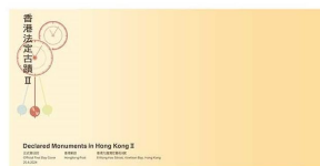
Official First Day Cover. 正式首日封。