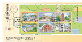
Serviced First Day Cover affixed with a Souvenir Sheet (date-stamped with associated special postmark). 貼有一張小全張的已蓋銷首日封 (以相關的特別郵戳蓋銷)。