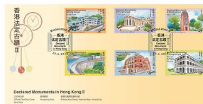
Serviced First Day Cover affixed with a set of mint stamps in six denominations (date-stamped with associated special postmark). 貼有一套六款面額郵票的已蓋銷首日封 (以相關的特別郵戳蓋銷)。