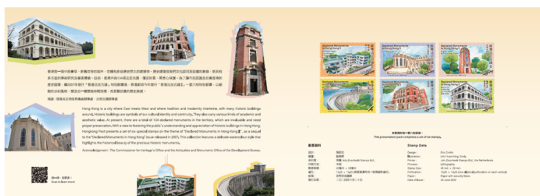
Presentation Pack (Inside). 套摺 (內頁)。