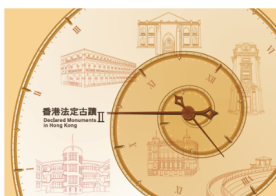
Presentation Pack (Cover). 套摺 (封面)。