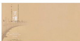
First Day Cover.