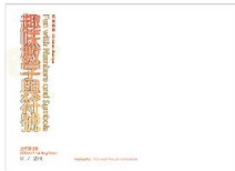
First Day Cover.