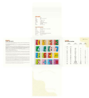
Presentation Pack (Inside).