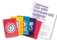
A set of 61 playing cards and game instructions.