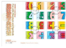
Serviced First Day Cover affixed with a set of 16 stamps.