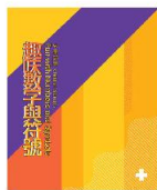
Souvenir Pack (Cover).