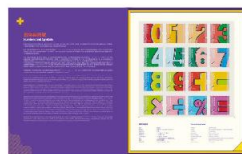
Souvenir Pack (Inside).