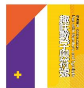
Presentation Pack (Cover).