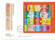
Serviced First Day Cover affixed with a souvenir sheet.