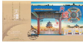
Serviced First Day Cover affixed with a Stamp Sheetlet.