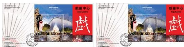
Serviced First Day Cover affixed with a $10 Stamp Sheetlet.