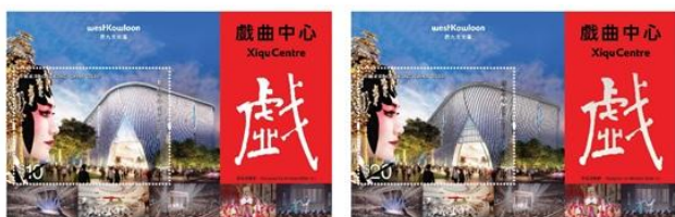
Stamp Sheetlet (containing a $10 stamp).