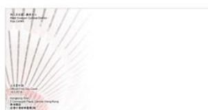
First Day Cover.