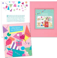
1. Moments to Treasure (Australia Post) 珍貴的時刻 (澳洲郵政)

Further information about these products can be obtained from the Hongkong Post Stamps website at stamps.hongkongpost.hk or by calling the Hongkong Post Philatelic Bureau hotline 2785 5711.