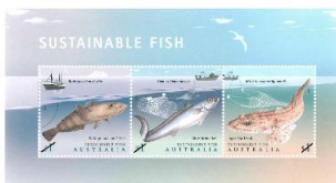
3. Sustainable Fish (Australia Post) 可持續性魚 (澳洲郵政)

Philatelic products issued by Australia Post. 澳洲郵政發行的郵票。