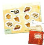
4. Sweet Canada (Canada Post) 甜蜜加拿大 (加拿大郵政)

Philatelic products issued by Australia Post. 澳洲郵政發行的郵票。