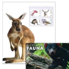
2. Australian Fauna (Australia Post) 澳洲的動物 (澳洲郵政)