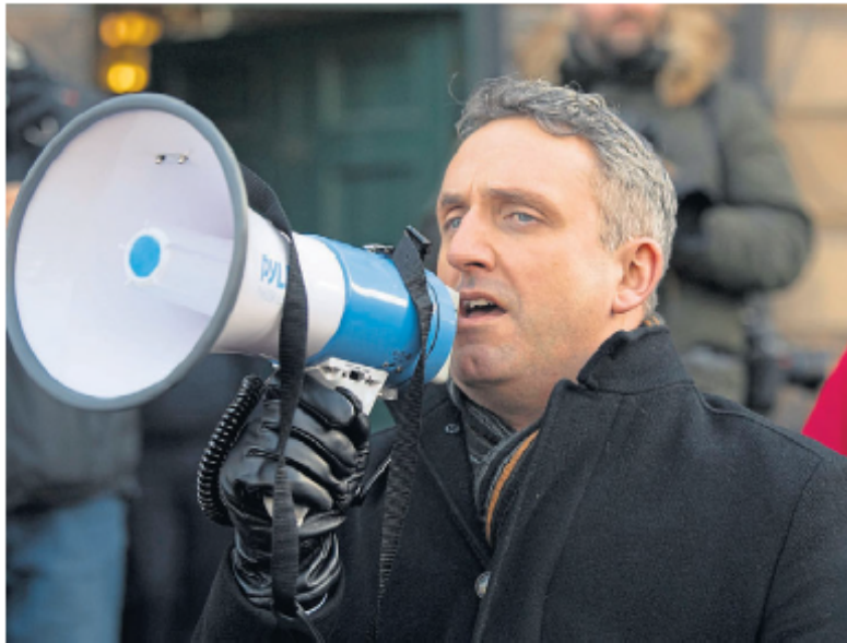
HEALTHY DEBATE: Scottish Lib Dem leader Alex Cole-Hamilton has called for action.