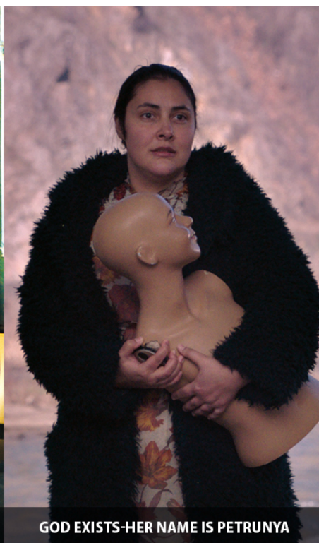
GOD EXISTS-HER NAME IS PETRUNYA