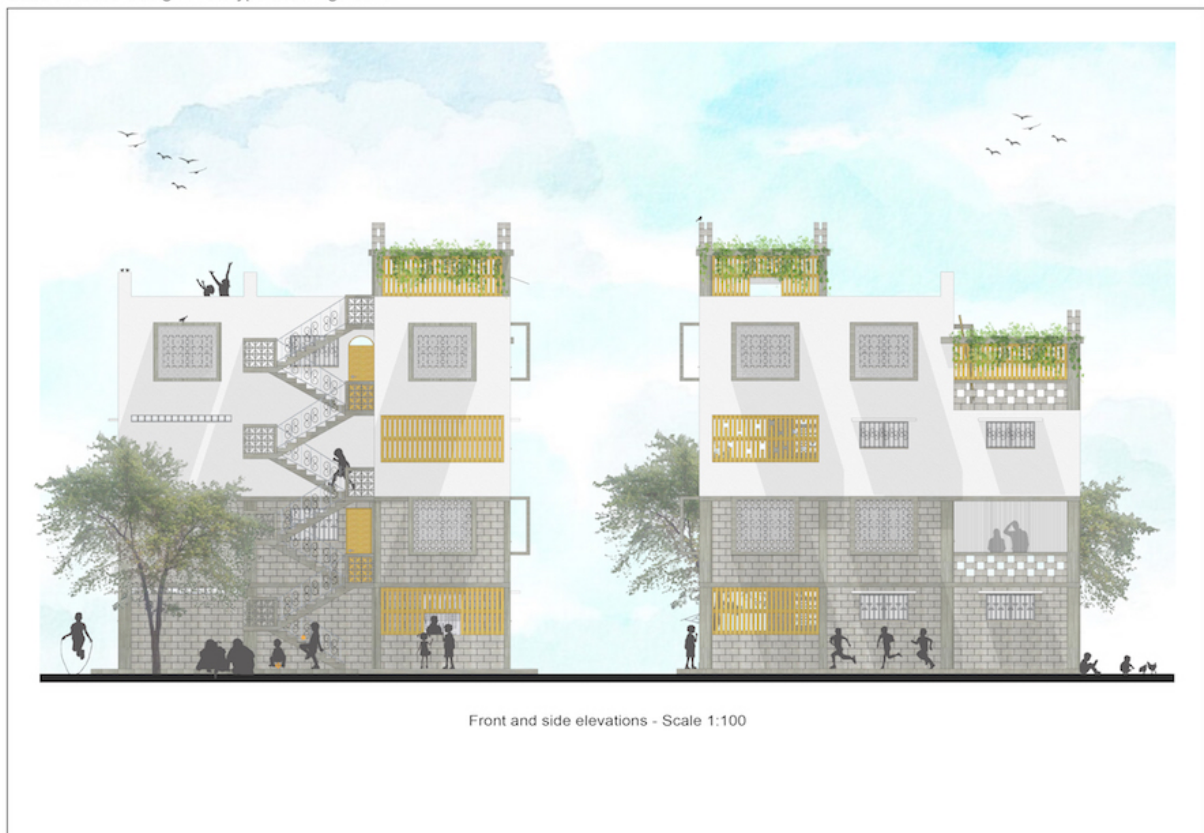
Gaza's House Design Prototype Drawings 2019

House Design Prototype for the Gaza Strip allowing future vertical incremental expansion for families affected by the conflict.