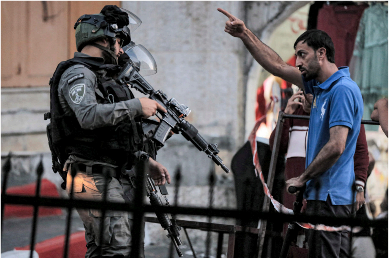
A Palestinian man argues with Israeli border guards in the flashpoint city of Hebron in the Israeli-occupied West Bank on June 18, 2021.

Under former Prime Minister Benjamin Netanyahu, Jewish extremists frequently breached the compound under police protection and provoked clashes with Muslim worshippers.