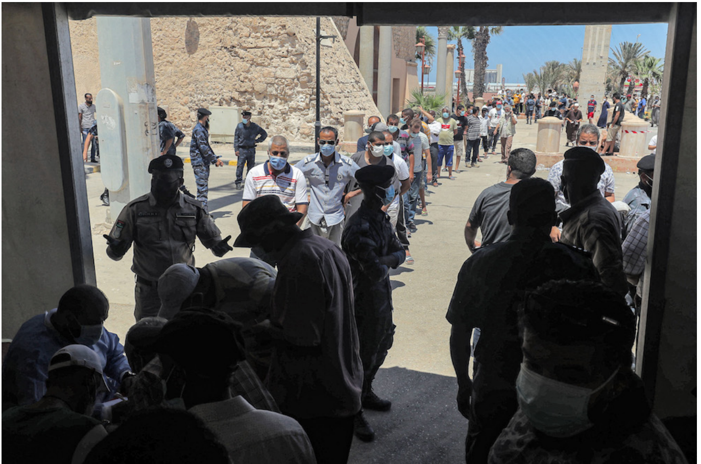
People queue as they arrive outside a make-shift COVID-19 coronavirus vaccination and testing centre erected at the Martyrs' Square of Libya's capital Tripoli on July 24, 2021.

administering more people with the vaccine compared to a number of other countries. And the cases you see are actually very minimal compared to previous waves, so I wouldn't worry much about Morocco," Abubakar said.