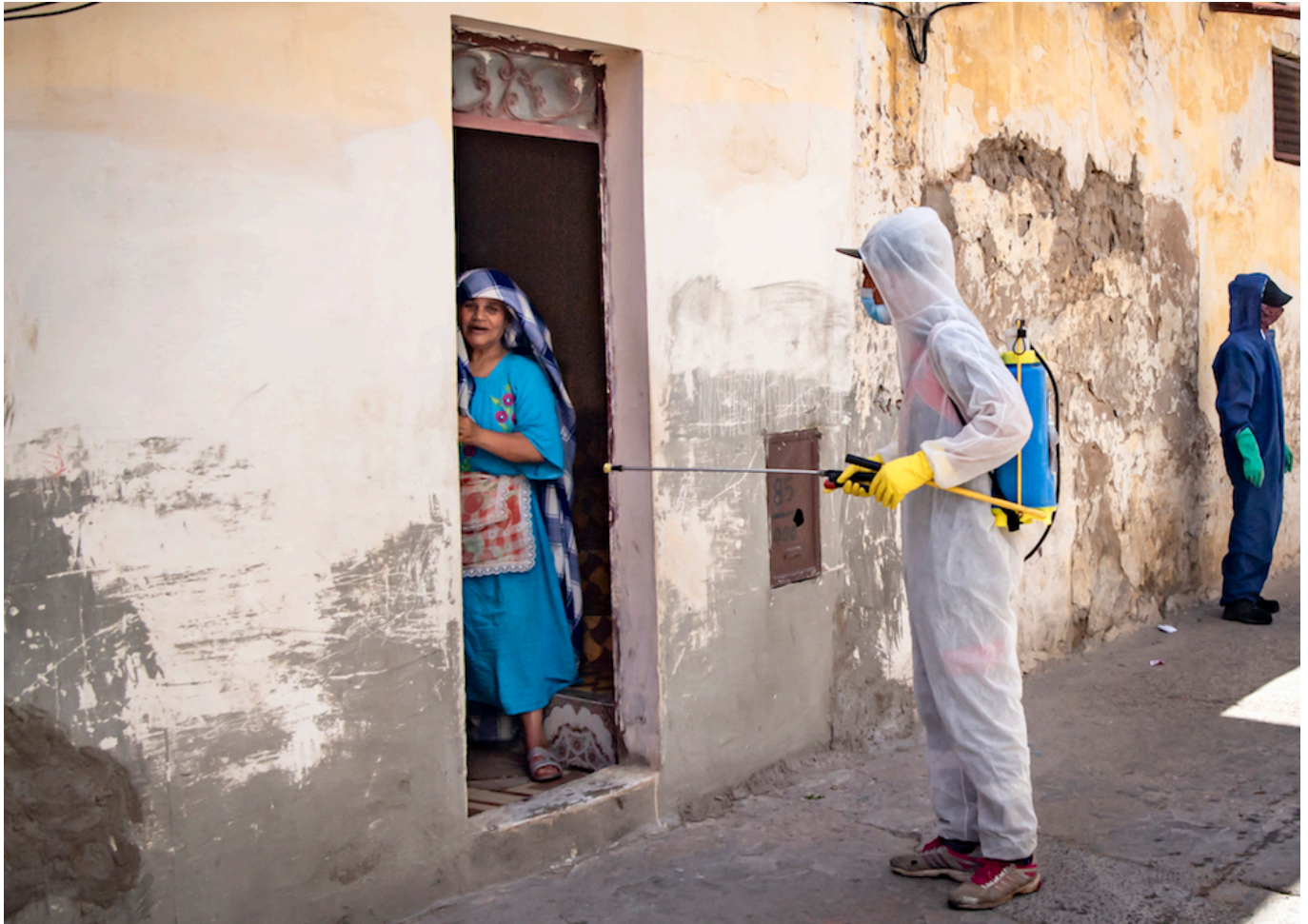
A Moroccan municipal worker disinfects outside a house in a closed street in the southern port city of Safi on June 9, 2020 after Moroccan authorities declared a total lockdown.

"The vaccination rate is very low, and the spread is fast. We must be quicker in our response. The most important thing we can do to stop the spread of COVID-19 and the variants, is ensure everyone who is eligible gets vaccinated.