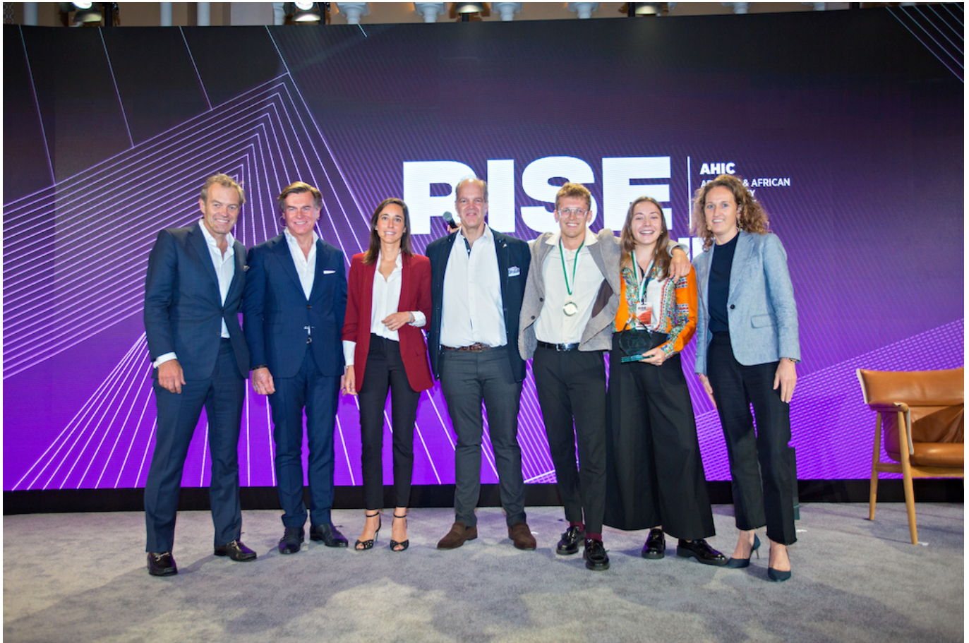
Picture from the stage from the award ceremony on stage at AHIC, in September 2021, with members of the jury and the winners.

solutions. Sustainability projects are the core of the multiple giga-projects in Saudi Arabia, (such as) NEOM.”