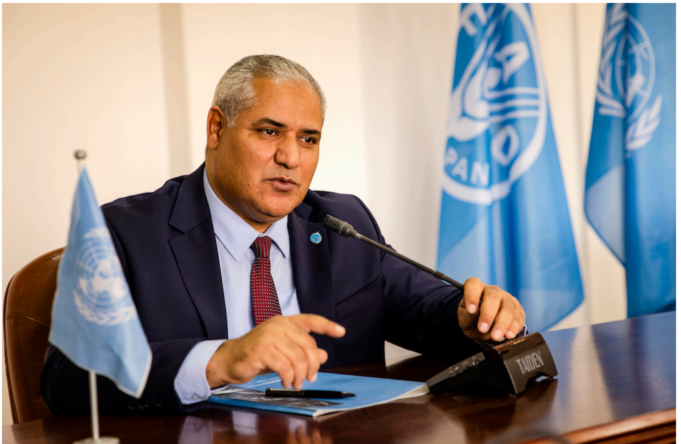
Abdulahakim Elwaer, assistant director-general and regional representative for the Near East and North Africa at the Food and Agriculture Organization of

Regardless of what policies governments enact, however, Elwaer said that climate change remains the single greatest threat to regional agriculture and food systems – particularly as it exacerbates existing water shortages.