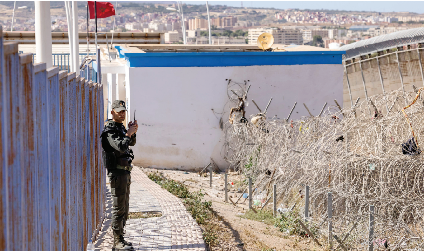
Main category: Middle-East