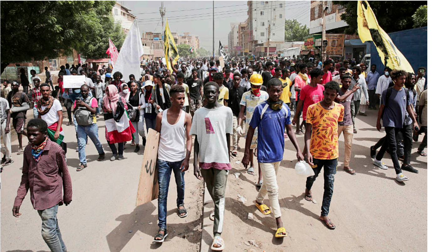
Main category: Middle-East