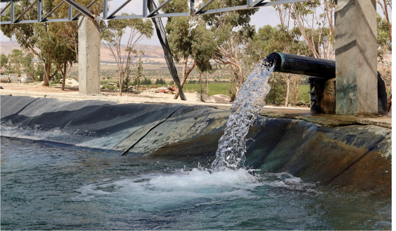
Main category: Middle-East