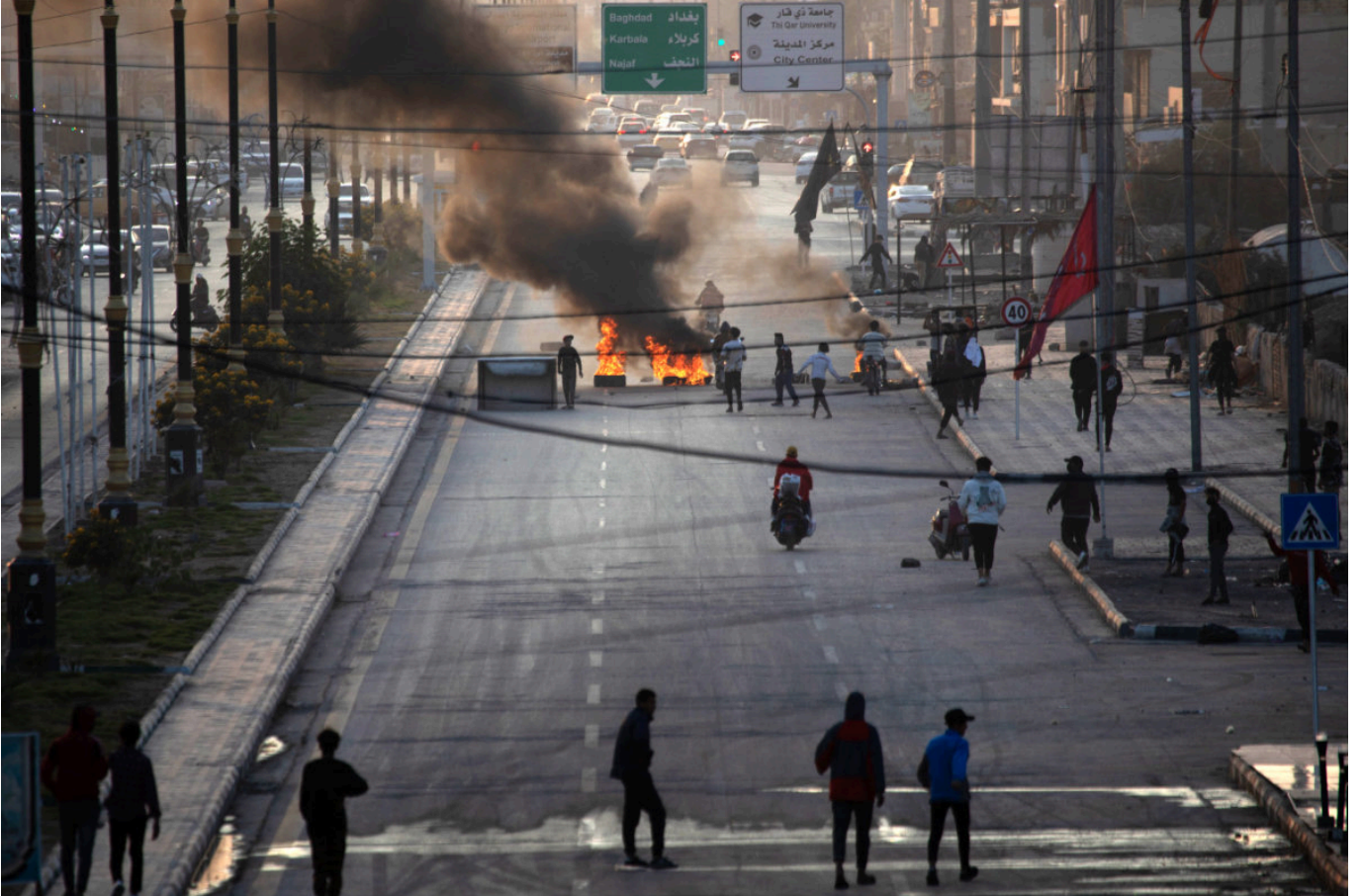
Main category: Middle-East