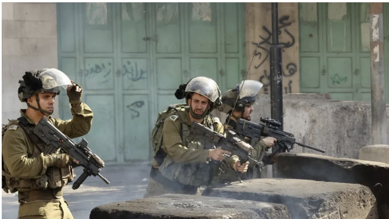
Main category: Middle-East