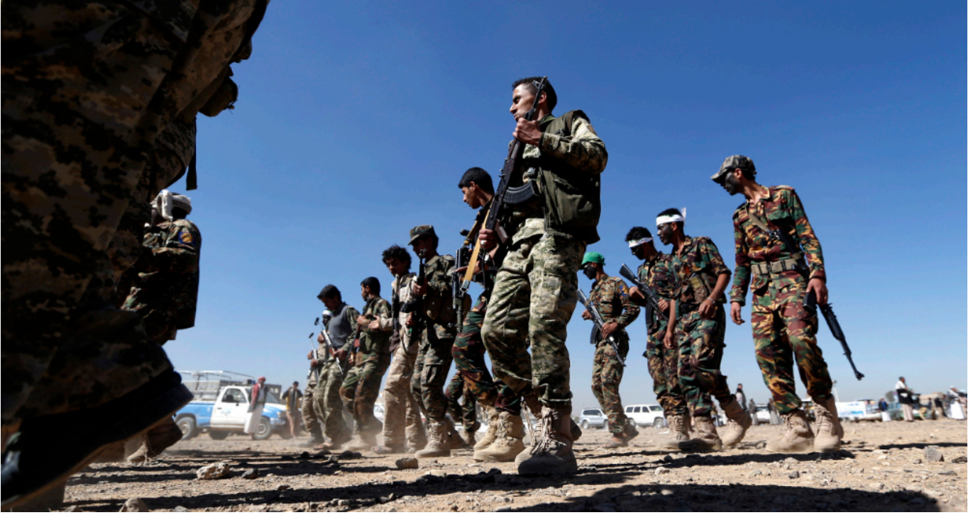
Main category: Middle-East