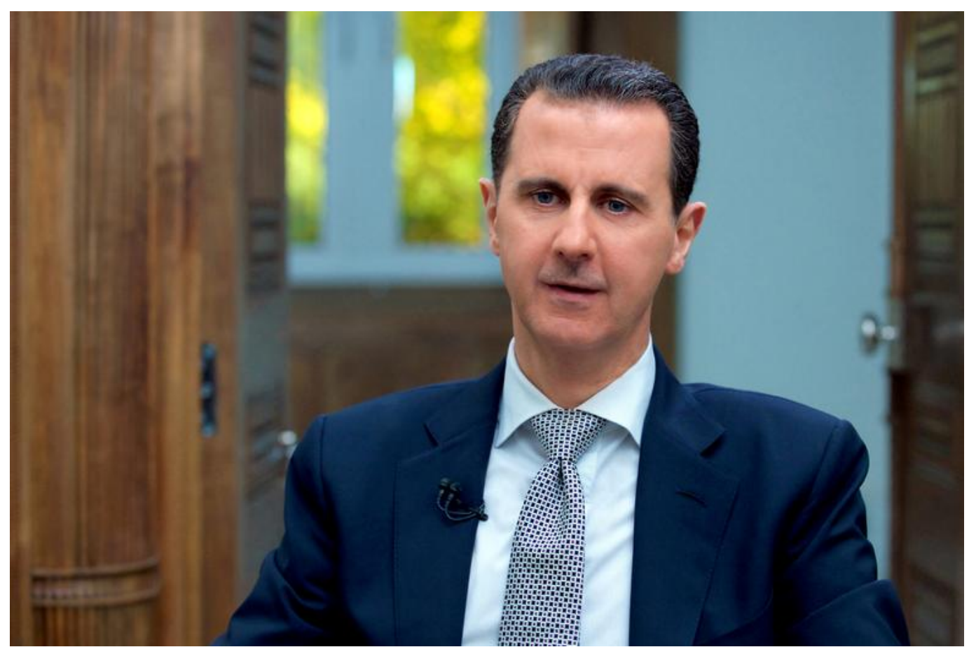
Main category: <u>Middle-East</u>